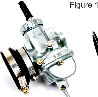
Carb adapter for OEM Honda CRF110 Keihin marked "BBR CRF Stock"